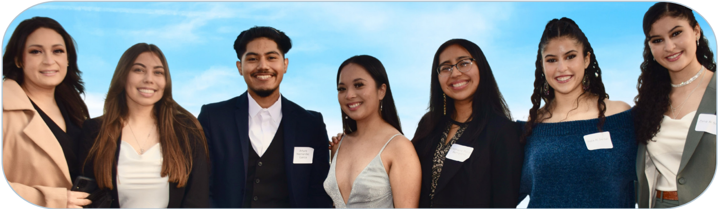
Evans CIP students volunteering at the 2021 Evening of Opportunity Gala