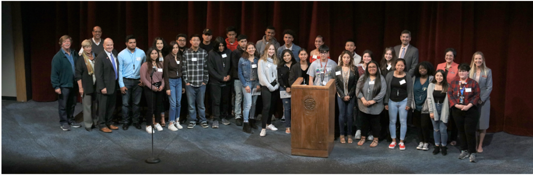
Representatives of the 2019 Group of Scholarship Winners

5 © 2021 Monterey Peninsula College. All Rights Reserved