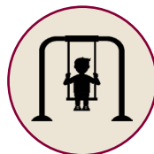
Early Childhood Education