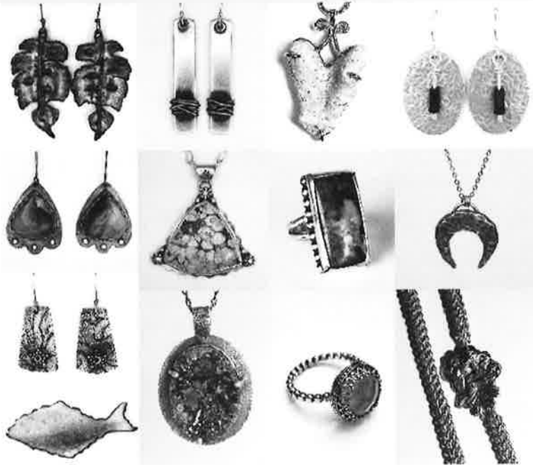
Theresa Lovering-Brown Jewelry and Metal Arts

May 5: 5 pm to 8 pm, May 6 and 7: 10 am to 5 pm 980 Fremont Street Monterey, CA 93940 follow campus signs, free parking