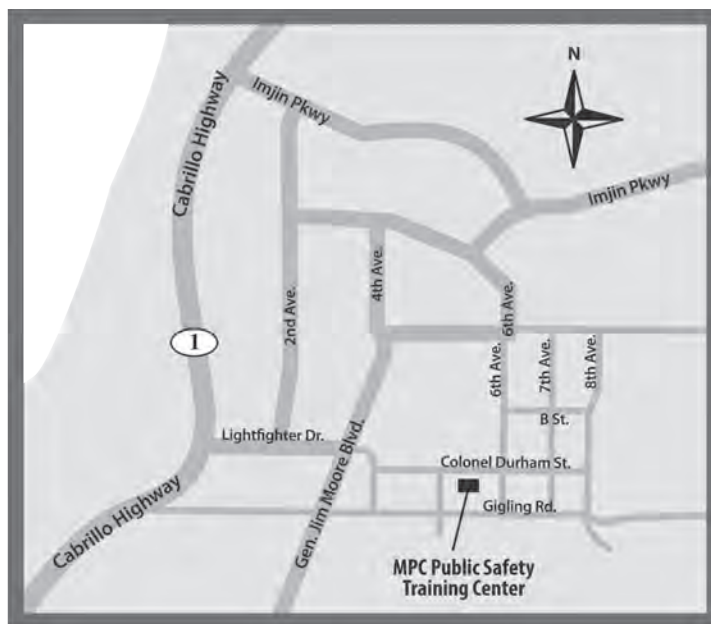
MPC PUBLIC SAFETY TRAINING CENTER 2642 Colonel Durham Street, Seaside, CA 93955