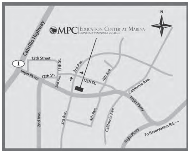
MPC EDUCATION CENTER AT MARINA 289 12th Street, Marina, CA 93933